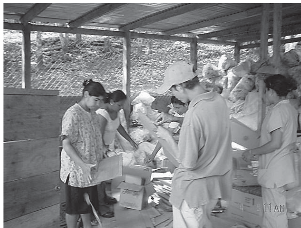
Youth sort paper and cardboard in spacious, airy new digs

young people collect recyclable paper and cardboard from businesses and offices in Matagalpa and the surrounding community. They clean and sort the paper to sell to a recycling firm in Managua. Until last winter, the Recycling Project operated out of an inadequate building which did not