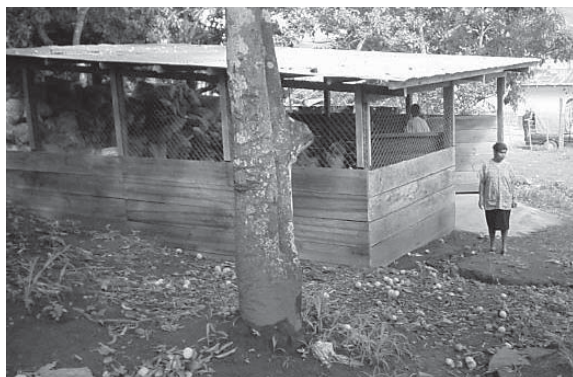
New recycling building now complete in Matagalpa, Nicaragua

provide the needed space or conditions for sorting and cleaning paper.