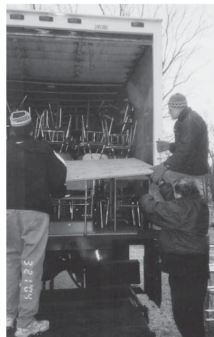
Loading desks in Kiel, Wisconsin

Clubs of Wisconsin, and to all who have helped us toward our goal of seating all the students in Mulukuku at desks of their own.