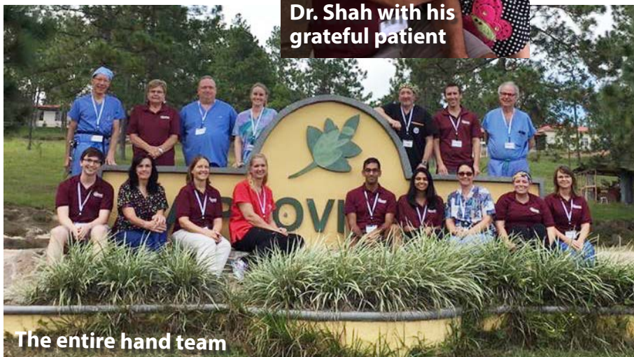
The entire hand team