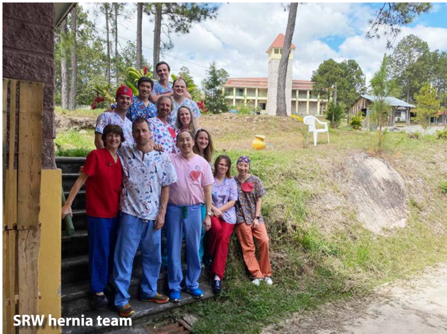
SRW hernia team