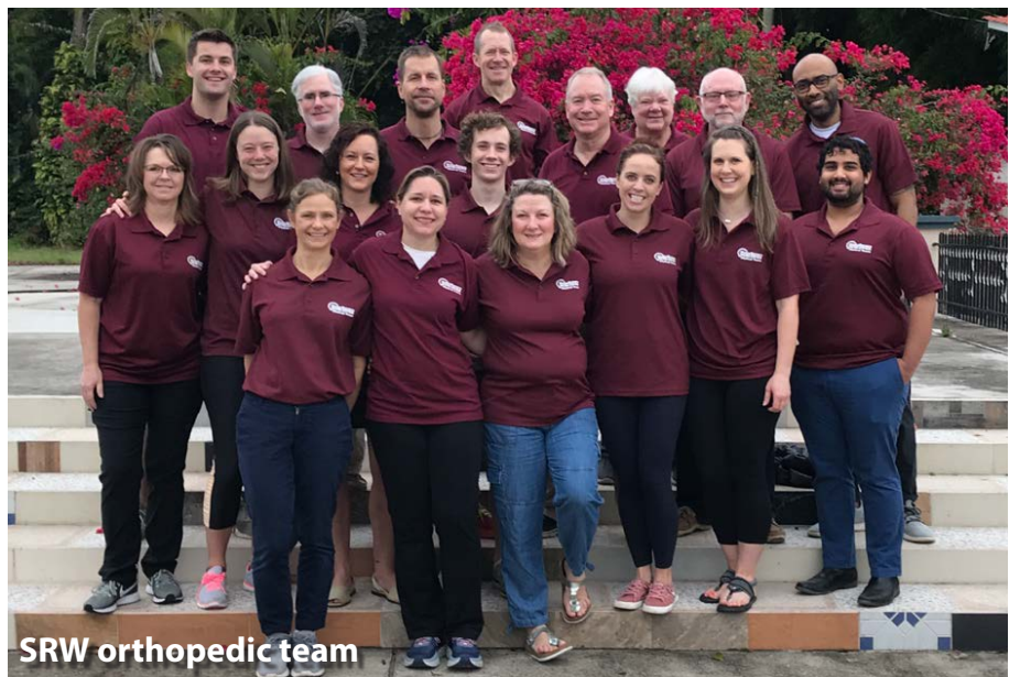
SRW orthopedic team

The orthopedic team screened 161 patients and 36 children had surgery the week of January 10-17, 2020 in Siguatepeque, Honduras at La Providencia. ●