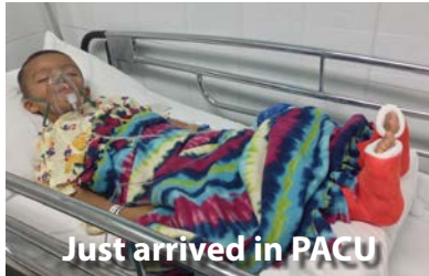
Just arrived in PACU

The world is a crazy place right now with the COVID-19 Pandemic happening. There are not enough supplies. Staff is being asked to reuse and conserve. There are too many patients and not enough staff. The world feels stressed. You know what else is stressed? The resources of a third world country. Only, the people of Honduras are kind, calm, and resourceful. The experience in Honduras changed me in a way that I never could have dreamed. I thought to myself, "I cannot wait to help these people." However, the people of Honduras provided more help and guidance to me than I could have ever imagined.