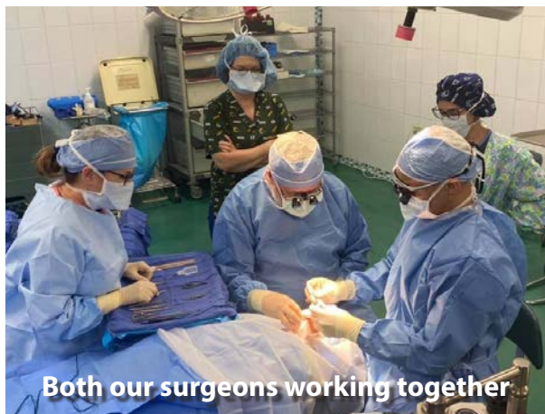
Both our surgeons working together

Our first few days in Honduras we went straight to screening the children. It was important to have an estimate on how many cases were surgical so we could plan the next few days appropriately. We had a few stragglers throughout the week that we made time for as well. Midweek, we started operating. The operating room was like nothing I had experienced before. It was