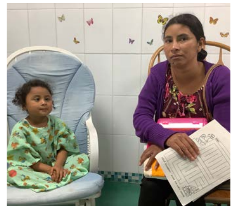
above: Waiting her turn for surgery

Locally, we donated similar items from our warehouse to local institutions and the Dane County Public Health Department for use in the community. We never have huge supplies of anything because of our limited storage space but it felt good to share what we have. ●