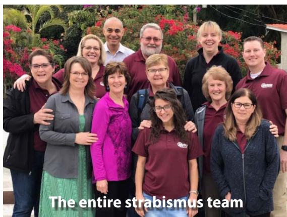
The entire strabismus team