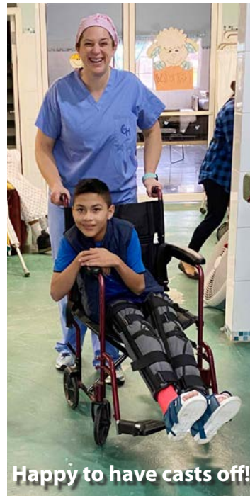
Happy to have casts off!

Honduras. This year we saw 31 patients and 43 braces need to be made for those children. This was accomplished Feb. 22–March 3, 2020. Our team members were all team members who also made the same trip last year. We cannot wait to see these patients next year and see their improved mobility in action. ●