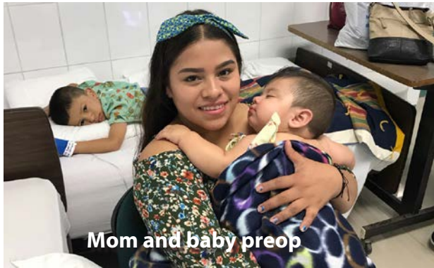
Mom and baby preop

I am grateful to have been able to join the team at Sharing Resources Worldwide for my first medical mission trip. We traveled to Siguatepeque, Honduras as a team of surgeons, anesthesiologists and nurses to provide perioperative care to children in need. Overall, this experience gave me a glimpse into global health discrepancies and provided me with a greater appreciation for the work I do and the resources available to me. ●