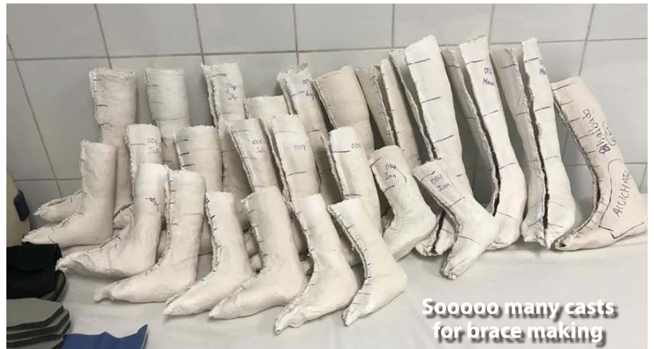
Sooooo many casts for brace making