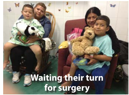
Waiting their turn for surgery

The long days never really seemed to be as long until we quietly loaded the bus for the trip home exhausted. We laughed together, cried together, and worked our tails off together making lemonade out of every lemon thrown our way. Even upon the sterilizer holding